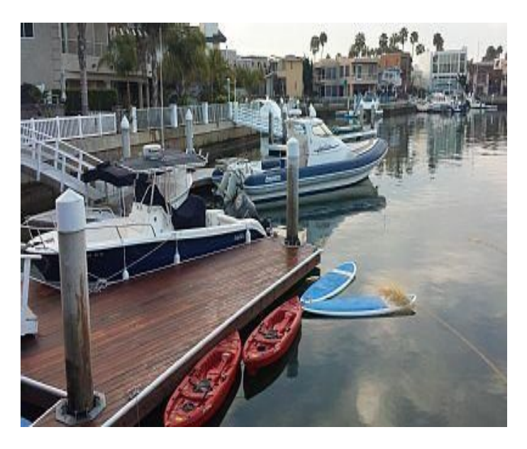
Walkway to Boat docking area