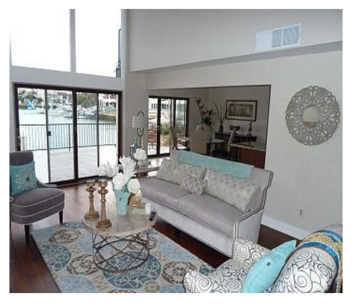
Living / Family Room