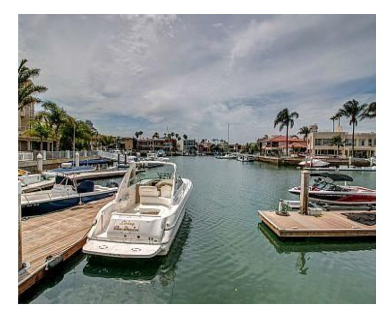
Mesmerizing private 3 channel view

Recommended for: Girls getaway, Tourists without a car, Adventure seekers, Age 55+, Romantic getaway