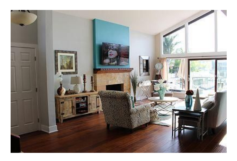
Living / Family Room