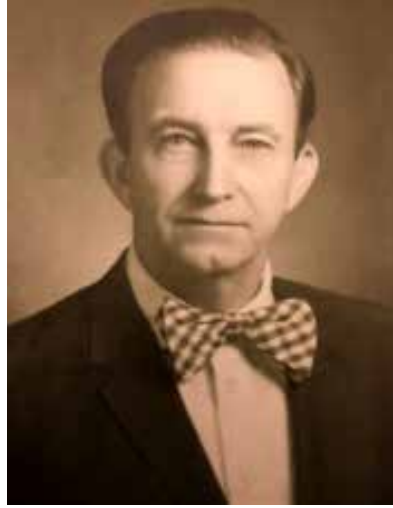
Orlando, Florida Circa 1975