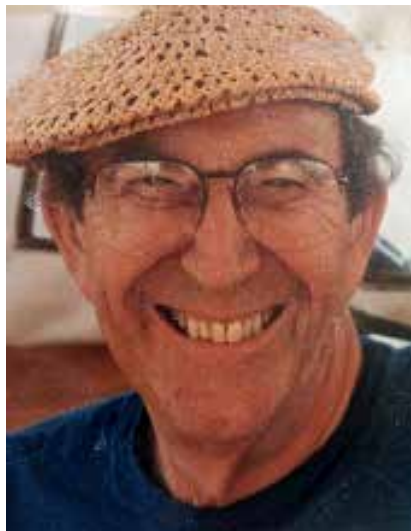
Celebrating Birthday #93 Hot Air Balloon ride (2013)